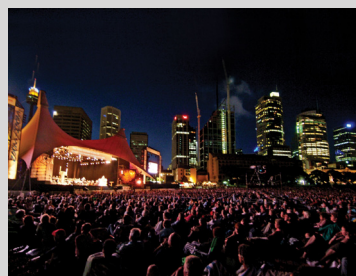
Opera Australia's outdoor performance of Tosca

In describing the effectiveness of the 2X LoadBalancer addition, Grant mentions that the product performed remarkably well, even given the fact that it was installed right as the company's IT crew was transitioning its outsourced IT help desk functionality to another source. The product has worked "flawlessly in