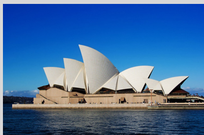
Sydney Opera House, performance center for Opera Australia

product pricing. However, he notes that when Opera Australia's 150 users logged in for server use, they were forced to choose which server they preferred for application hosting. Without an idea of the demands already placed upon their server of choice, Grant had no way of efficiently balancing application demands with available resources among his server base, resulting in highly inefficient application delivery and slow network speeds, testing the ability of the Opera Australia staff to meet their opera production targets.